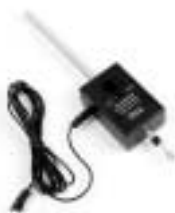
With hook for connecting to a string and measuring pulling force